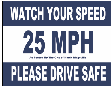
DESIGN 1 - $15.00

Below are the current signs approved by the Homeowners Association Board of Directors. If you are interested one of the signs below, please send an email to info@hamptonplace.org with your name and address. Someone will then contact you to place the order.